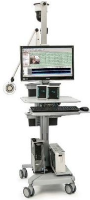
ErgoJust EEG Cart