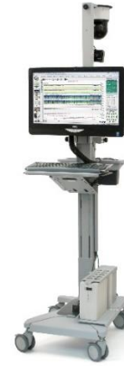
ErgoJust ICU Cart